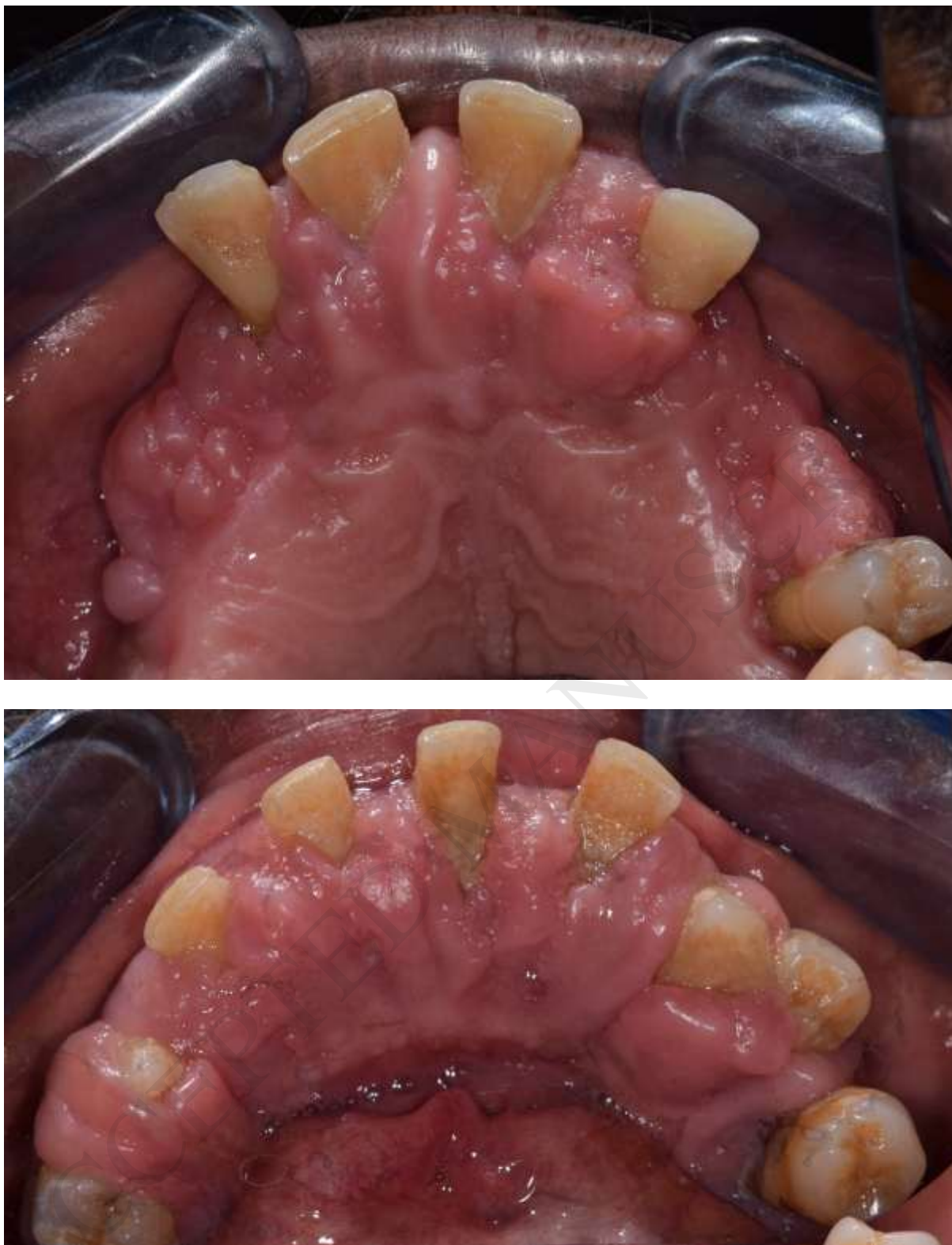
Figure 2: Panoramic radiograph showing terminal periodontitis with important bone loss.