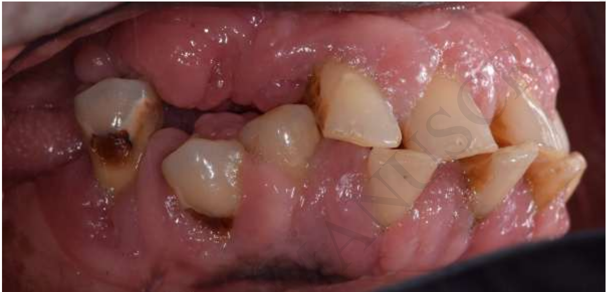
Figure 1: Gingival enlargement affecting both buccal and lingual/palatal sides, predominantly on anterior teeth. a: right lateral view, b: frontal view, c: left lateral view, d: maxillary arch, e: mandibular arch.